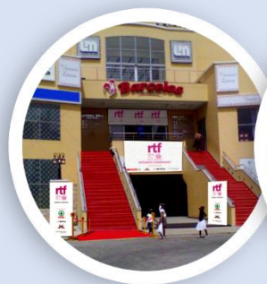
FILMHOUSE SURULERE (LEISURE MALL)