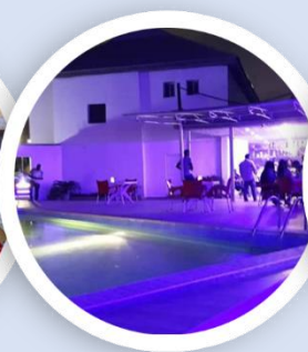
PRESKEN HOTELS (SHONIBARE ESTATE)