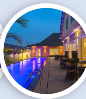
PROTES HOTELS - L'EOLA (MARYLAND ESTATE)