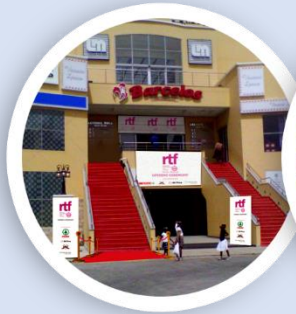
FILMHOUSE SURULERE (LEISURE MALL)