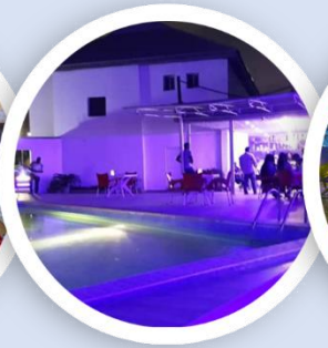
PRESKEN HOTELS (SHONIBARE ESTATE)